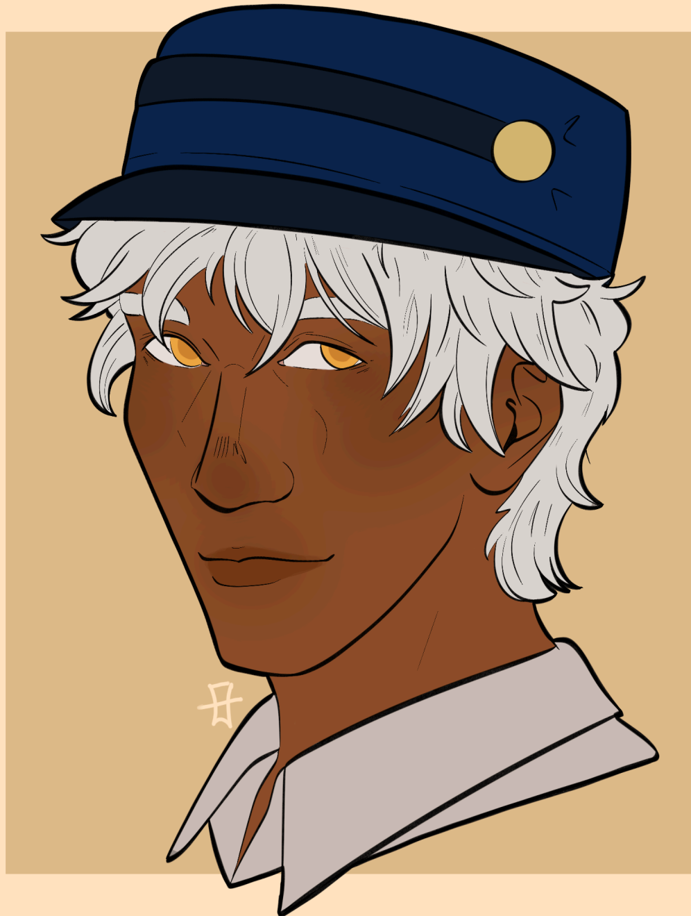
By: carelesapples (Tumblr / Discord) Note: Image depicts AT-1225 in a Human AU