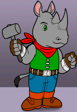
Faru Mhunzi Rhino