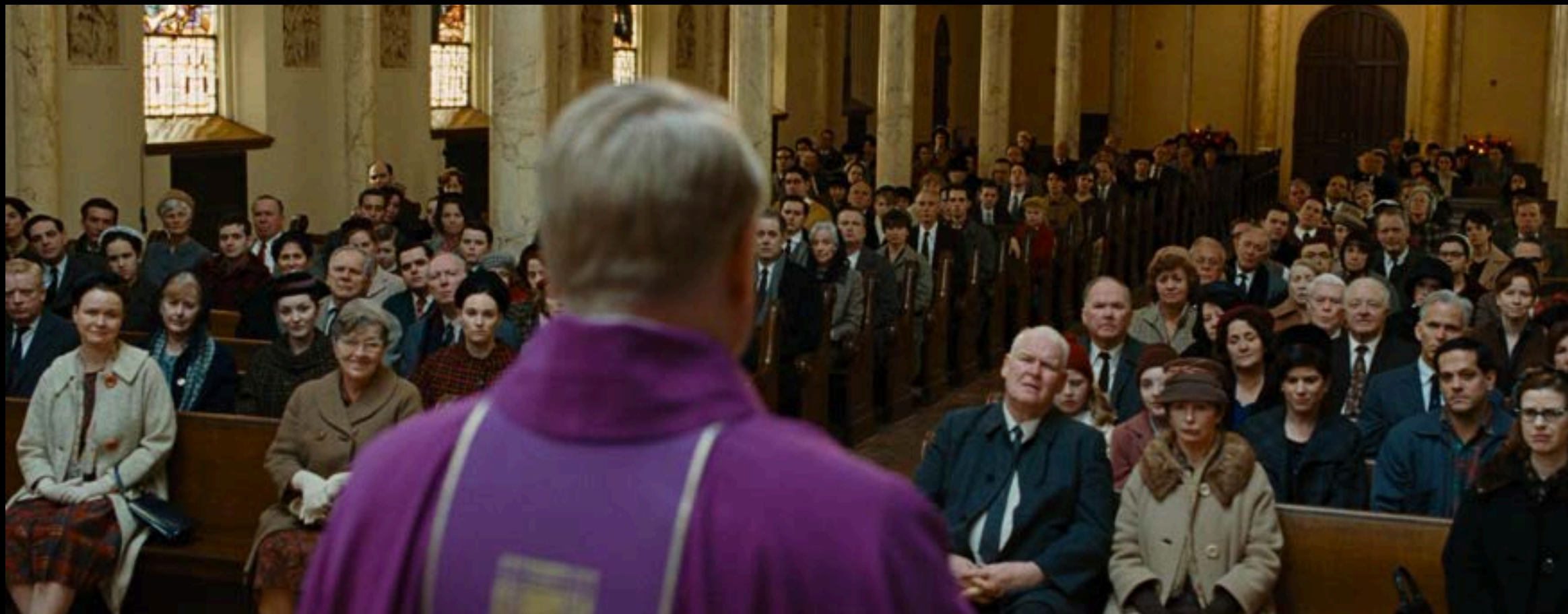
Doubt (2008) dir. John Patrick Shanley