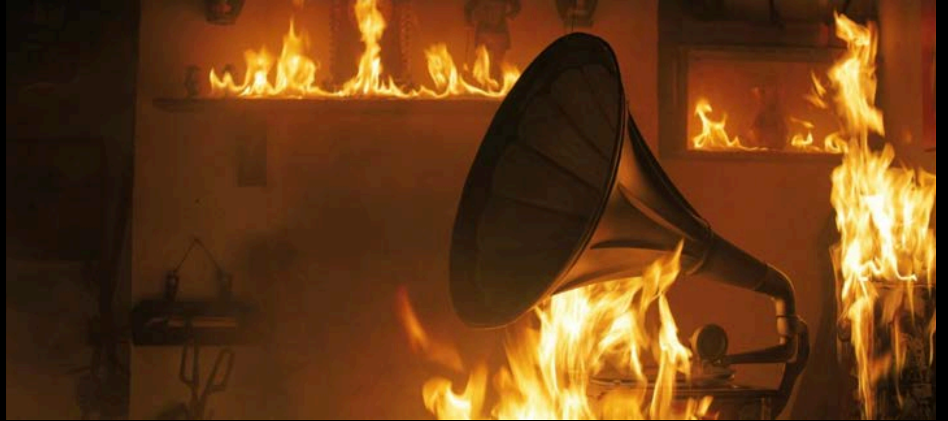
The Banshees of Inisherin (2022) dir. Martin McDonagh