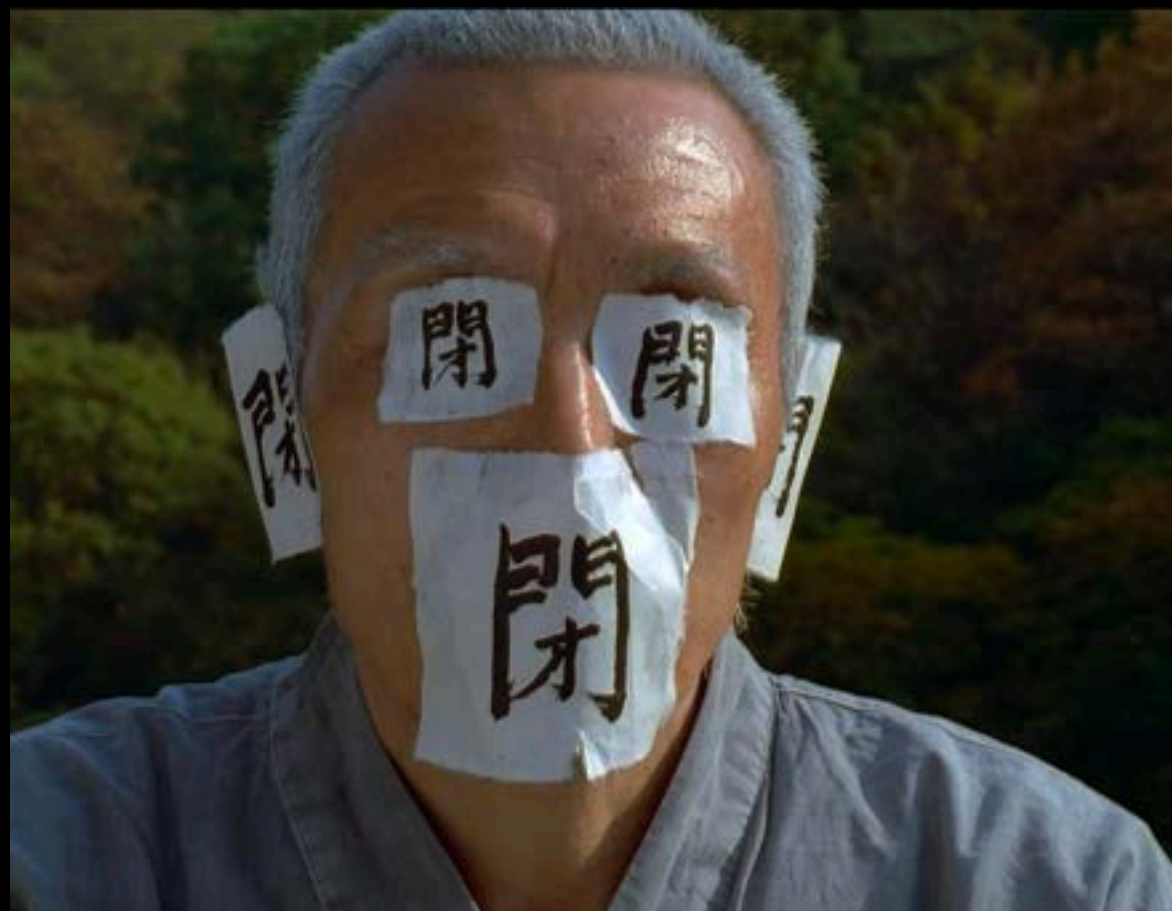
Spring, Summer, Fall, Winter... and Spring (2003) dir. Kim Ki-duk