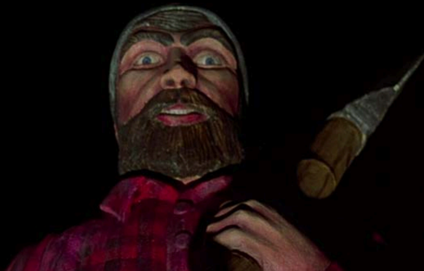
Fargo (1996) dir. Joel and Ethan Coen