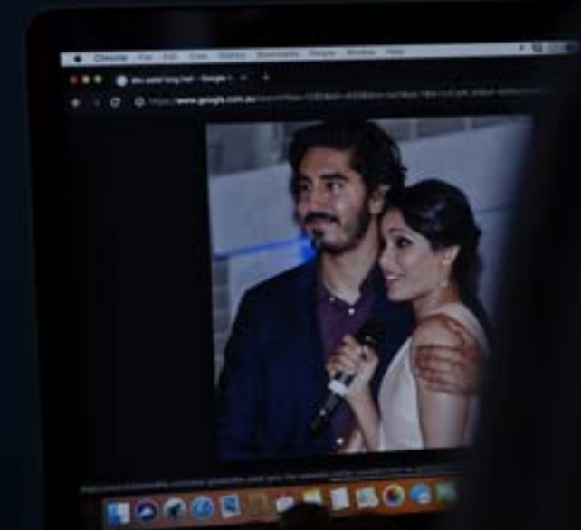
Bondi Boy (2025) dir. Rhavin Banda