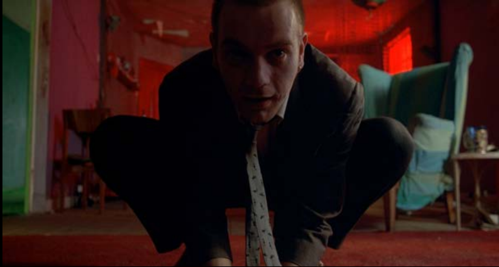
Trainspotting (1996) dir. Danny Boyle