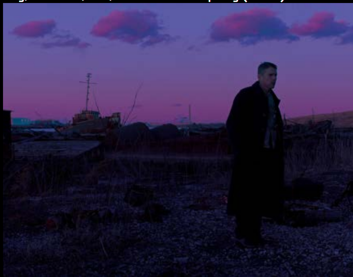
First Reformed (2017) dir. Paul Schrader