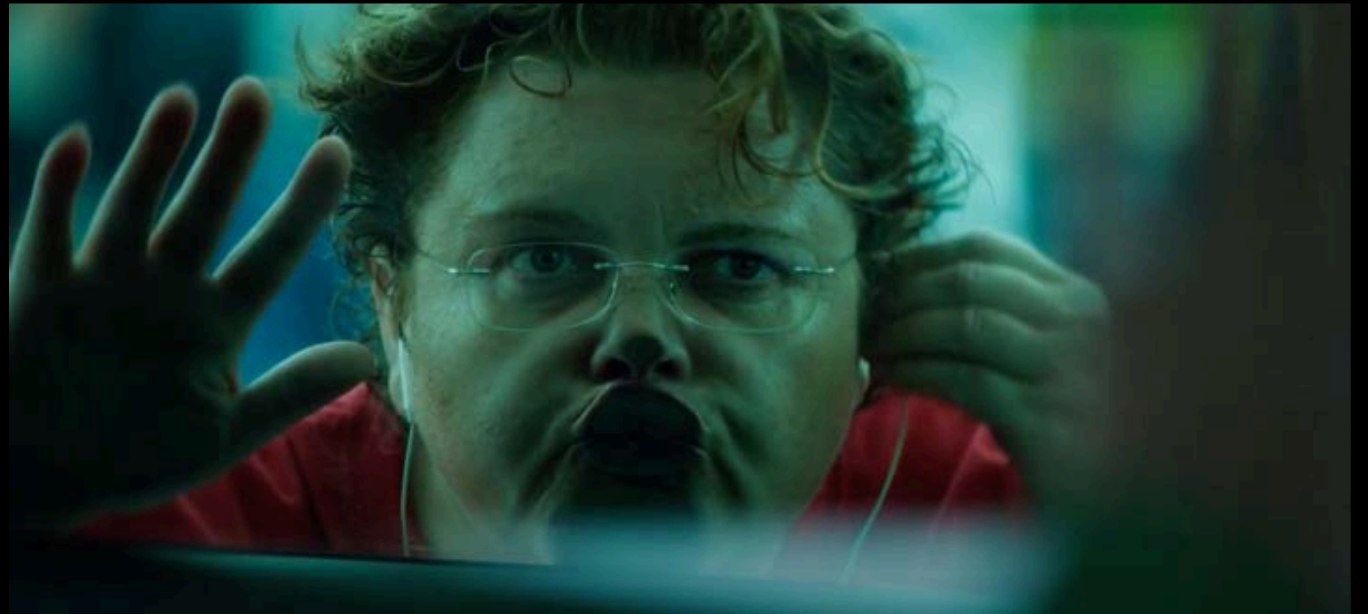
Fairplay (2022) dir. Zoel Aeschbacher